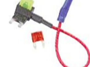
ATM fuse; main fuse at specified circuit rating up to 30A max. Added circuit up to 10A max.