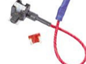
Low-profile ATM fuse; main fuse at specified circuit rating up to 30A max. Added circuit up to 10A max.