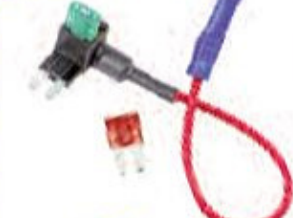
ATR 2-leg micro fuse; main fuse at specified circuit rating up to 30A max. Added circuit up to 10A max.